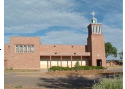
Church of the Good Shepherd